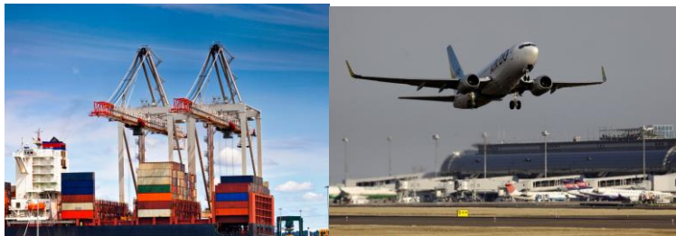
Sendai Shiogama Port