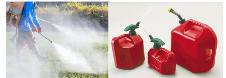
Storage, handling, and transport of hazardous materials/goods and poisonous substances.