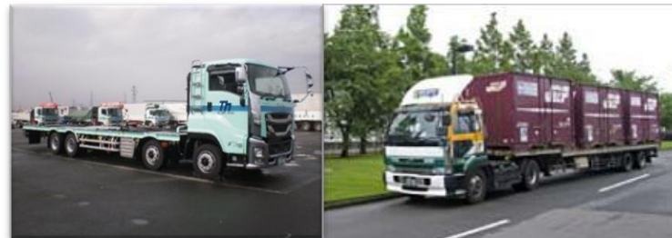
Collection and transport of cargo to and from freight rail stations as well as handling of rail cargo.